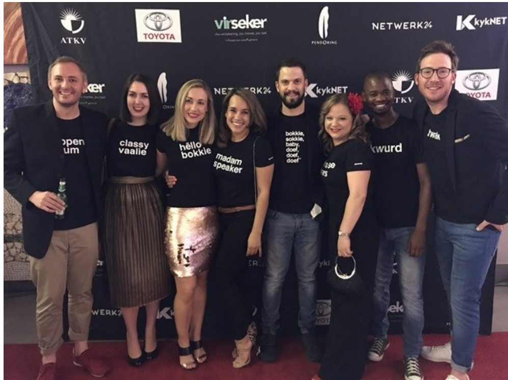
Abnormal Group at #Pendoring2017.

The Pendoring Awards not only reward marketing communication in all of SA's indigenous languages apart from English, they've also created their own ranking. I found out why fifth-ranked Abnormal Group believes brands need to realise the power of mother-tongue communication in preserving our heritage.